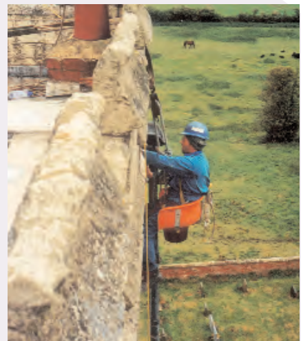
St. Helen's Church, Skipworth

HEAD OFFICE: KELLAW ROAD | DARLINGTON | CO. DURHAM DL1 4YA TEL: 01325 282794 | FAX: 01325 487329 | MOB: 07971 173626