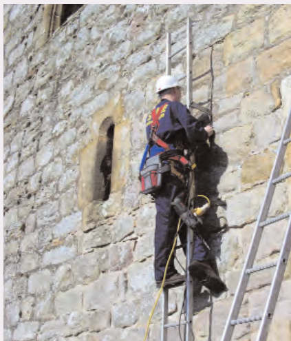
Bolton Priory and Barden Tower