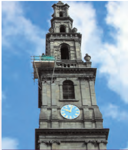
Holy Trinity Church, Leeds