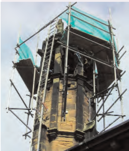
St Margaret's Church, Brotten