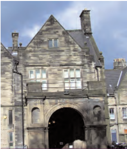
Pendower Hall, Newcastle